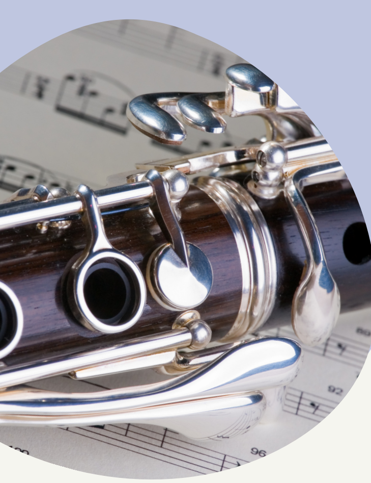
Purchasing a musical instrument